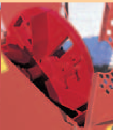
HJ 5 cutting disc