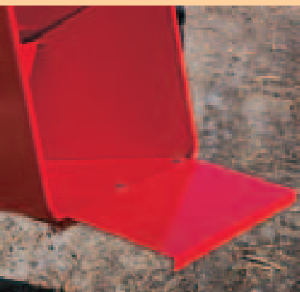
HJ 4 M Infeed chute extension