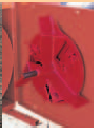
HJ 4 cutting disc