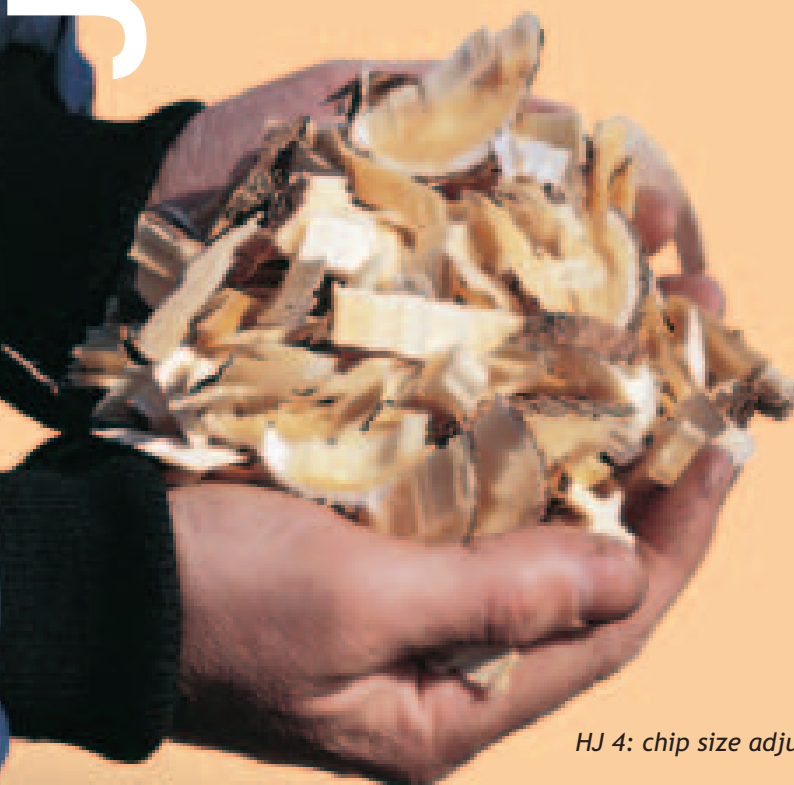
HJ 4: chip size adjusted to 8 mm

The cutting disc has blower blades that help spreading the chips directly back into nature. The loader chute and peak can be rotated, making it possible to direct the chips into a tractor or lorry container.