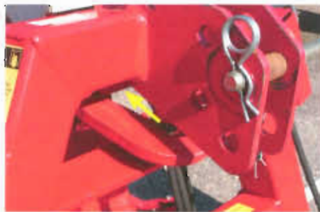
The articulating headstock is standard.

The system also ensures that the rake follows the tractor into curves, which gives sufficient space for curve passages and uneven fields. When lifting the rake automatically swings into the neutral centre position where it is locked. The R 460 DS have a shock absorber which absorbs the movement when lifting.