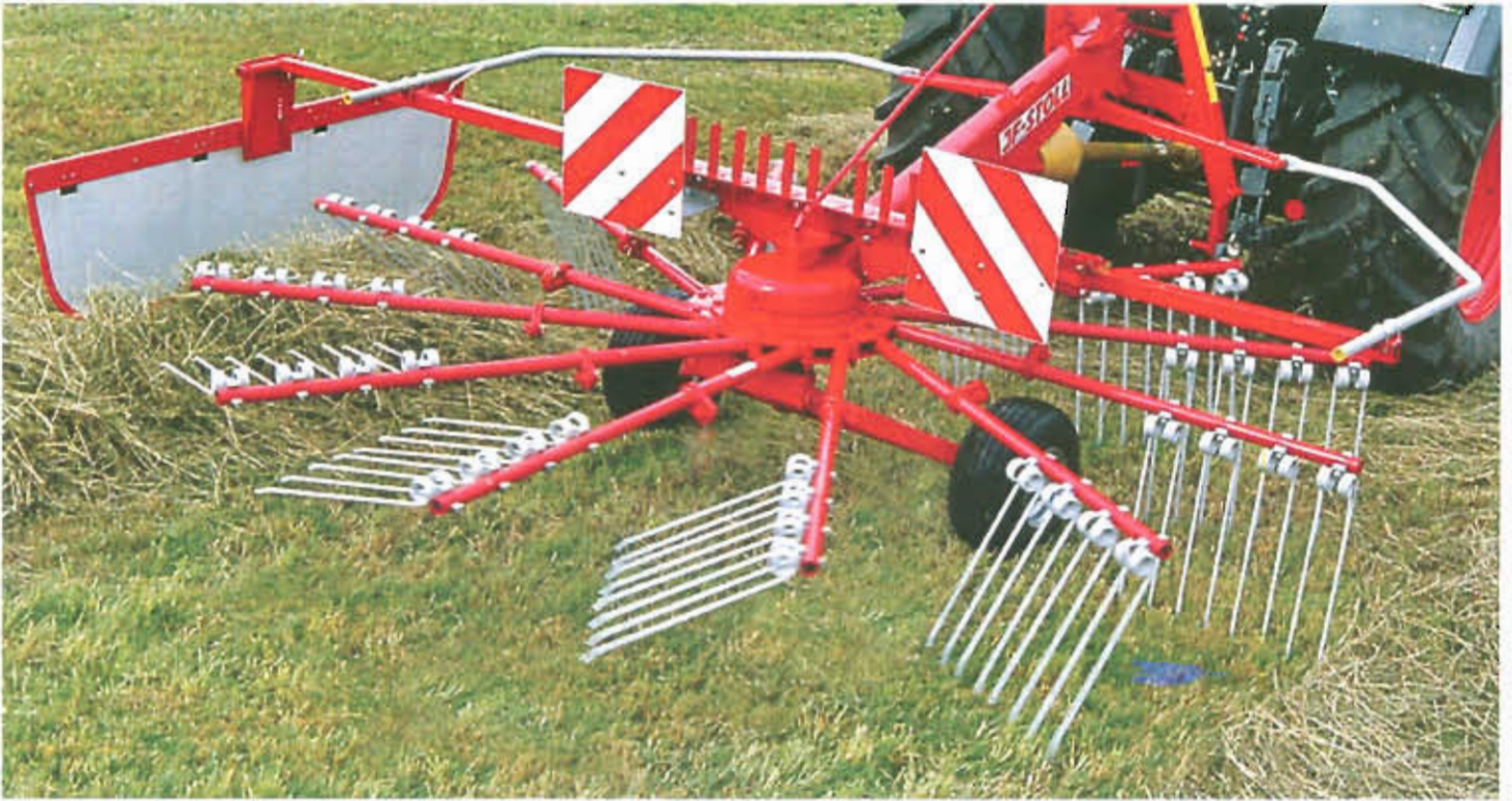
R 420 DS