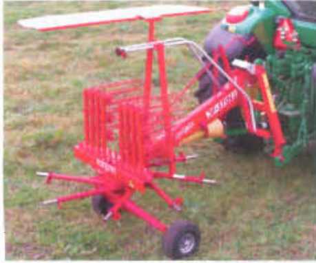
R 285 DS in transport - with both dismantled and mounted tine arms.

All the rakes have in spite of the working width a narrow transport width. When all the detachable tine arms are placed in the line arm holder the transport width is only 1.60 m (R 460 DS 1.90 m).