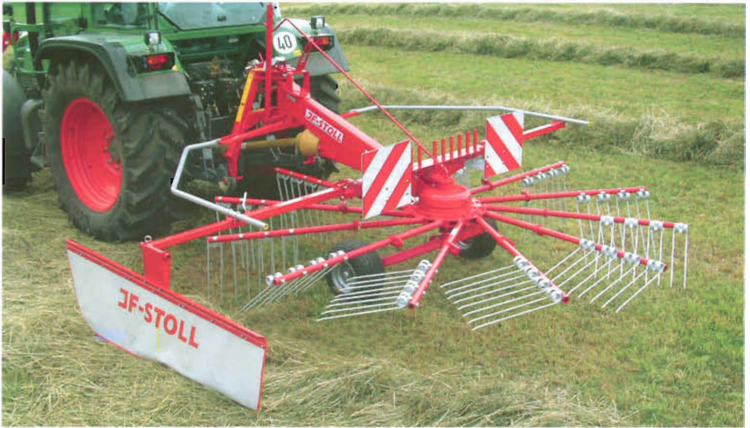
R 420 DS