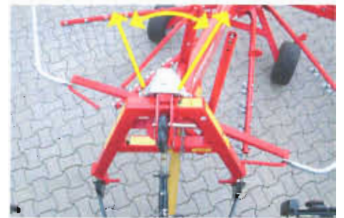
The articulating 3-point headstock is designed so that the rake follows the tractor around corners