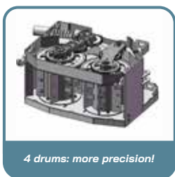
4 drums: more precision!